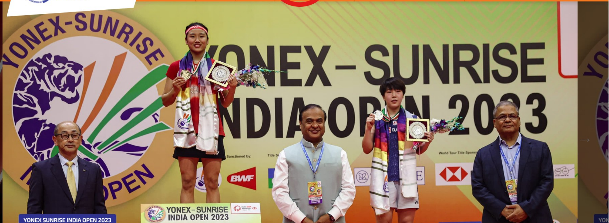
YONEX SUNRISE INDIA OPEN 2023